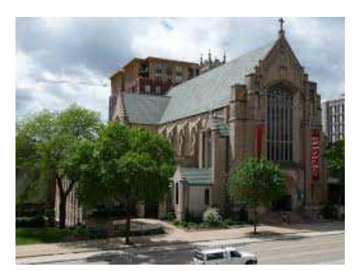
Luther Memorial Church

Altar Guild Adventure — May 14, 2014 Participants will leave Sears parking lot, Brookfield, in the luxury bus at 8 am — OR — meet the bus at St. Dunstan's, Madison, at 9:15 am.