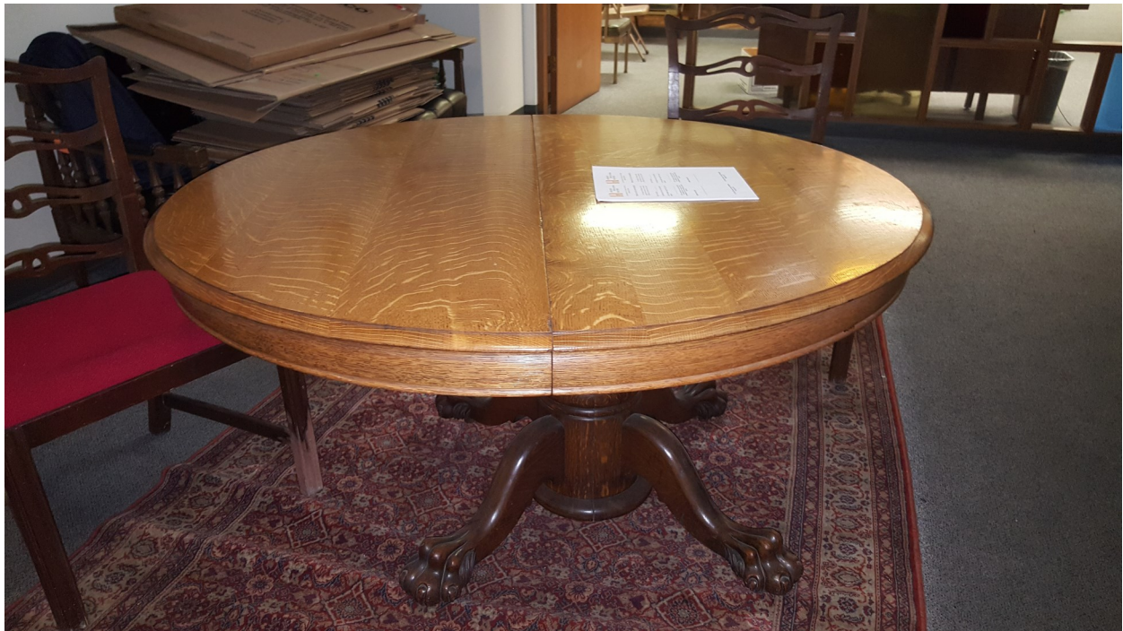
Photo 7: Large wood table (requested for purchase by future building occupant)