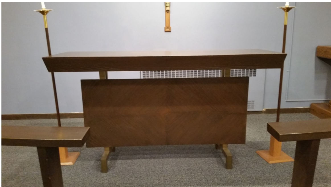
Photo 4: Altar (contemporary style, metal legs, 4-feet high, 6-feet wide, 2-feet deep)